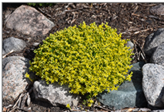
Golden Moss Stonecrop in bloom

Golden Moss Stonecrop is recommended for the following landscape applications;