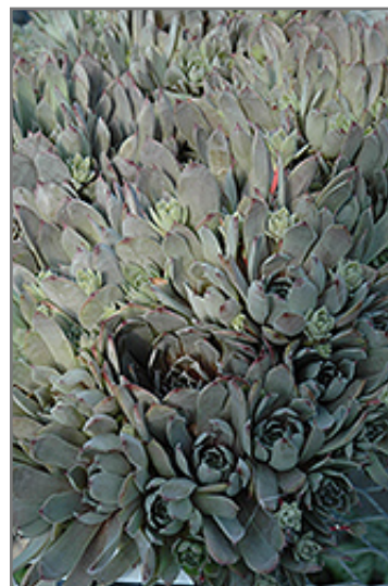
Big Blue Hens And Chicks

Big Blue Hens And Chicks is recommended for the following landscape applications;