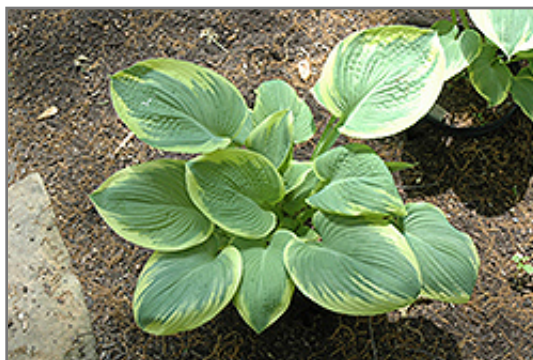
Robert Frost Hosta