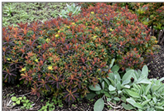
Bonfire Cushion Spurge