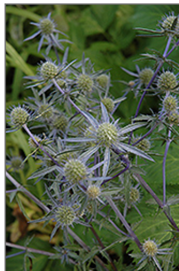
Blue Cap Sea Holly flowers

Blue Cap Sea Holly is recommended for the following landscape applications;