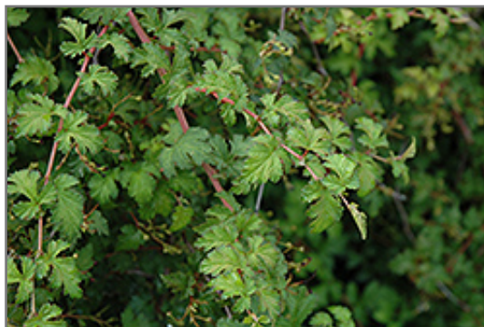
Cutleaf Stephanandra foliage