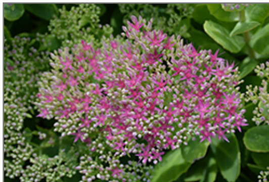
Neon Stonecrop flower buds

Neon Stonecrop will grow to be about 20 inches tall at maturity, with a spread of 20 inches. When grown in masses or used as a bedding plant, individual plants should be spaced approximately 16 inches apart. It grows at a fast rate, and under ideal conditions can be expected to live for approximately 15 years. As an herbaceous perennial, this plant will usually die back to the crown each winter, and will regrow from the base each spring. Be careful not to disturb the crown in late winter when it may not be readily seen!