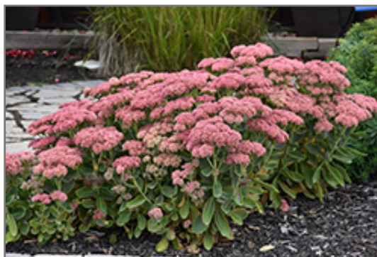
Autumn Fire Stonecrop in bloom

Autumn Fire Stonecrop is recommended for the following landscape applications;