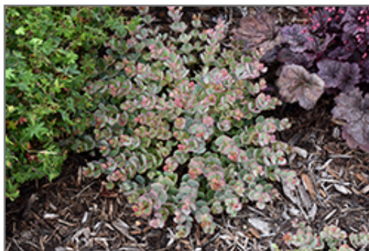
October Daphne