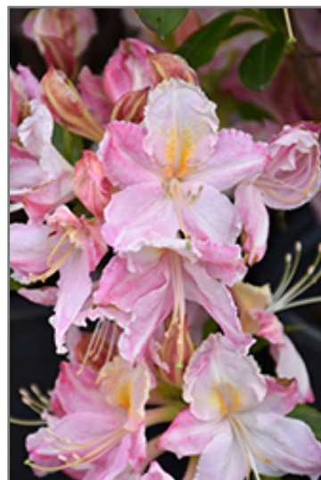
Tri-Lights Azalea flowers