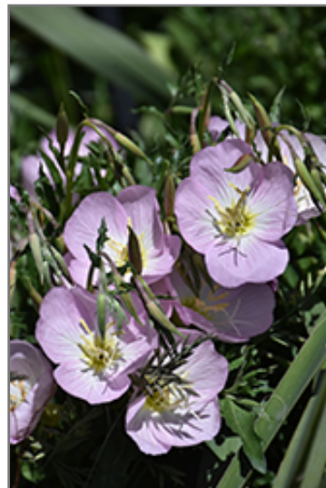
Evening Primrose flowers