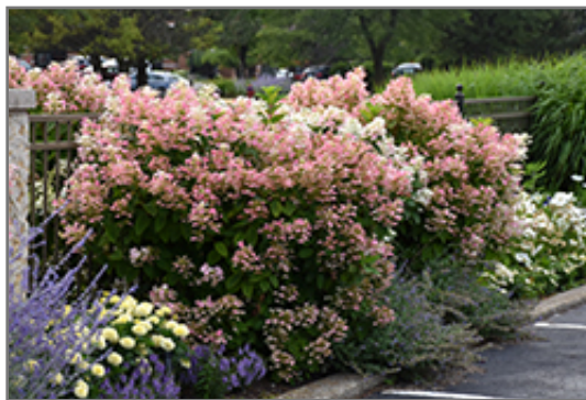
Quick Fire Hydrangea in bloom