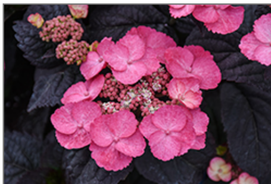
Pink Dynamo Hydrangea flowers

Pink Dynamo Hydrangea is recommended for the following landscape applications;