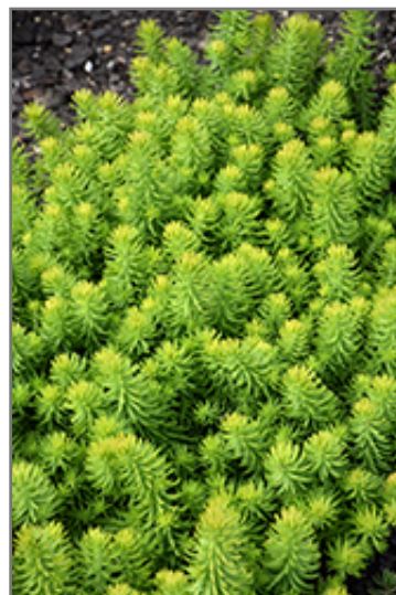
Prima Angelina Stonecrop

Prima Angelina Stonecrop is recommended for the following landscape applications;