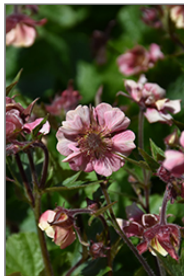
Tempo Rose Avens flowers

Tempo Rose Avens is recommended for the following landscape applications;