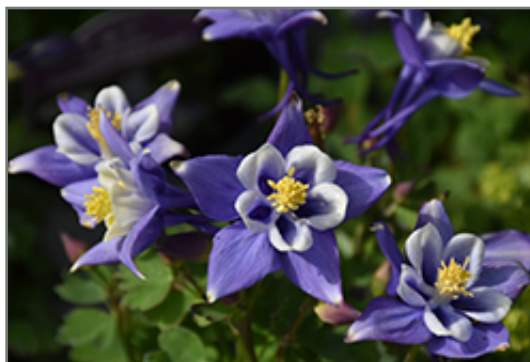
Earlybird Blue and White Columbine flowers