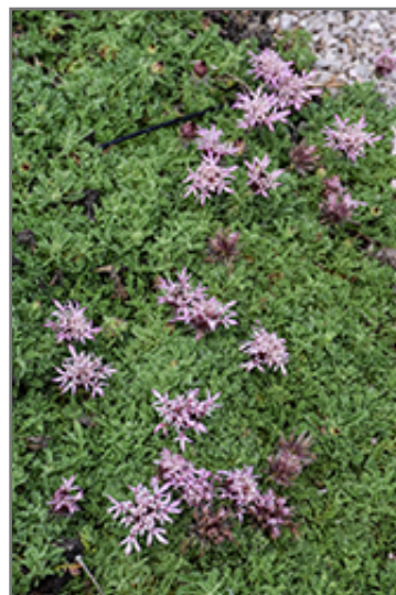
Carpeting Pincushion Flower in bloom

Carpeting Pincushion Flower is a dense herbaceous evergreen perennial with a ground-hugging habit of growth. It brings an extremely fine and delicate texture to the garden composition and should be used to full effect.