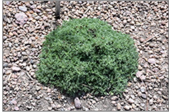
Carpeting Pincushion Flower