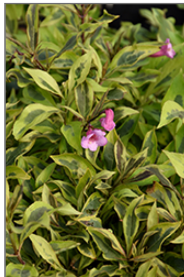
Bubbly Wine Weigela flowers