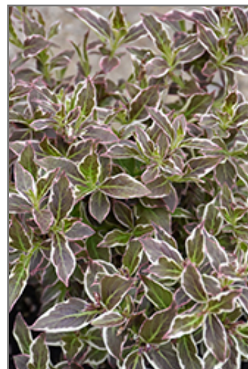
My Monet Purple Effect Weigela foliage