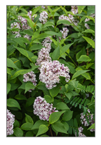
Baby Kim Lilac flowers