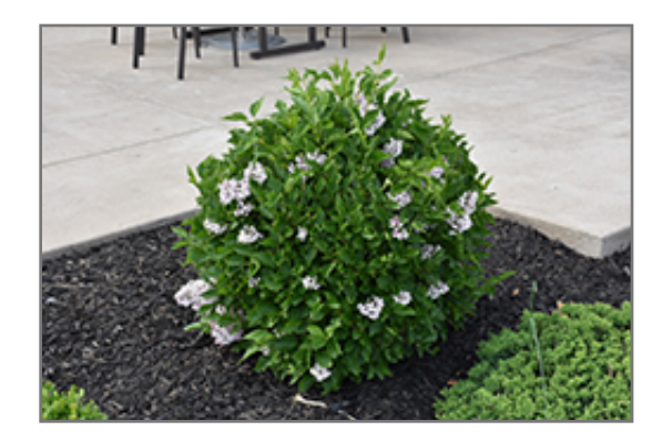
Baby Kim Lilac in bloom