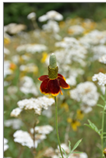
Red Midget Mexican Hat flowers

Red Midget Mexican Hat is recommended for the following landscape applications;