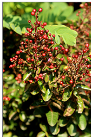
Barista Dark Roast Crapemyrtle flower buds