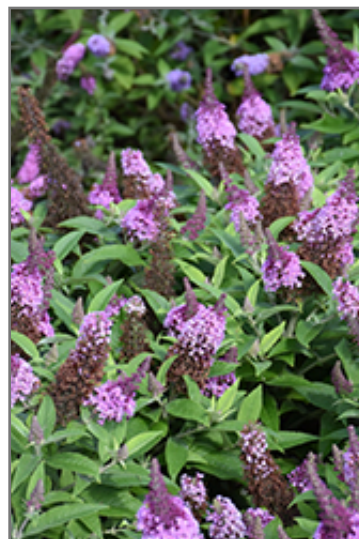
Chrysalis Pink Butterfly Bush flowers

Chrysalis Pink Butterfly Bush is recommended for the following landscape applications;