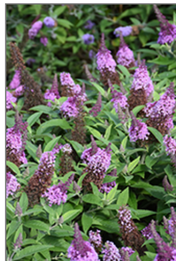
Chrysalis Pink Butterfly Bush flowers

Chrysalis Pink Butterfly Bush is recommended for the following landscape applications;