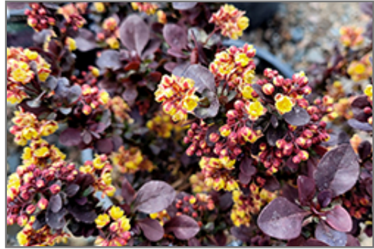
Concorde Japanese Barberry flowers

Concorde Japanese Barberry will grow to be about 18 inches tall at maturity, with a spread of 24 inches. It tends to fill out right to the ground and therefore doesn't necessarily require facer plants in front. It grows at a slow rate, and under ideal conditions can be expected to live for approximately 20 years.