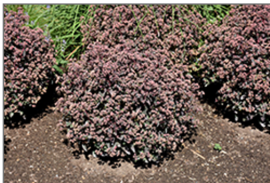
Rock 'N Grow Tiramisu Stonecrop in bloom