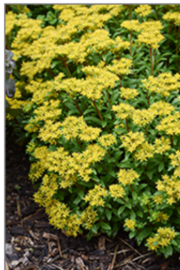
Rock 'N Round Bright Idea Stonecrop in bloom