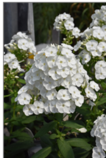
Luminary Backlight Garden Phlox flowers

Luminary Backlight Garden Phlox is recommended for the following landscape applications;