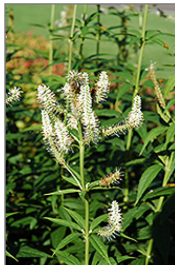
Culver's Root flowers