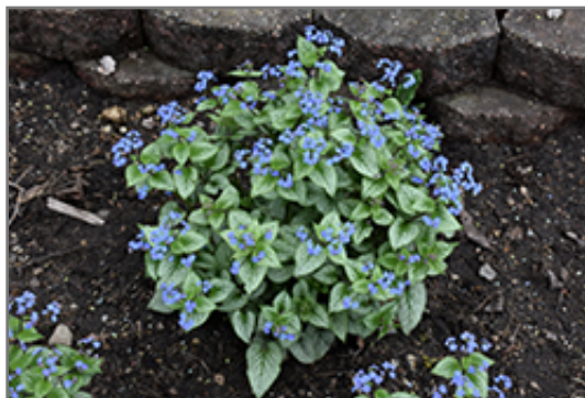
Sterling Silver Bugloss in bloom