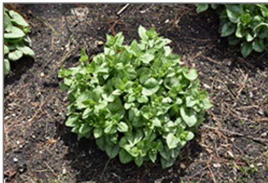
Jack of Diamonds Bugloss

Jack of Diamonds Bugloss will grow to be about 14 inches tall at maturity, with a spread of 30 inches. When grown in masses or used as a bedding plant, individual plants should be spaced approximately 28 inches apart. It grows at a medium rate, and under ideal conditions can be expected to live for approximately 10 years. As an herbaceous perennial, this plant will usually die back to the crown each winter, and will regrow from the base each spring. Be careful not to disturb the crown in late winter when it may not be readily seen!