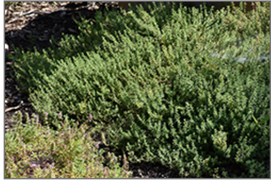
Common Thyme

This plant is quite ornamental as well as edible, and is as much at home in a landscape or flower garden as it is in a designated herb garden. It should only be grown in full sunlight. It prefers to grow in average to dry locations, and dislikes excessive moisture. It is considered to be drought-tolerant, and thus makes an ideal choice for a low-water garden or xeriscape application. It is not particular as to soil type or pH. It is highly tolerant of urban pollution and will even thrive in inner city environments. Consider covering it with a thick layer of mulch in winter to protect it in exposed locations or colder microclimates. This species is not originally from North America. It can be propagated by division.