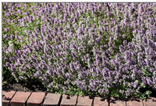
Common Thyme in bloom

Common Thyme is smothered in stunning clusters of pink flowers at the ends of the stems from early to mid summer. Its attractive tiny fragrant round leaves remain grayish green in colour throughout the year.