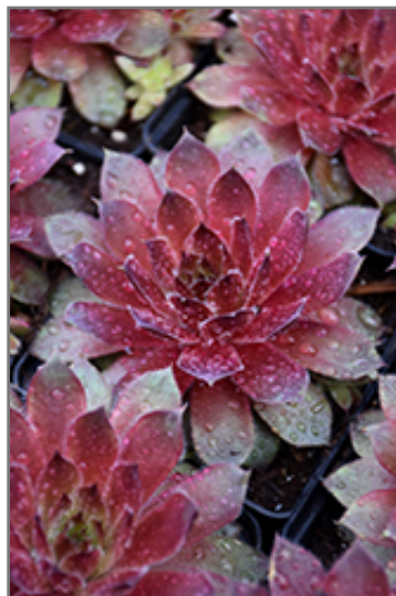
More Honey Hens And Chicks