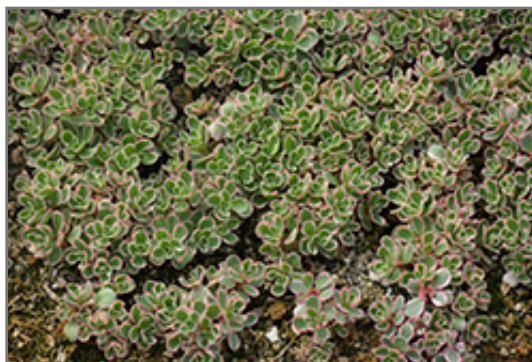
Tricolor Stonecrop flowers

Tricolor Stonecrop will grow to be only 4 inches tall at maturity, with a spread of 18 inches. When grown in masses or used as a bedding plant, individual plants should be spaced approximately 15 inches apart. Its foliage tends to remain low and dense right to the ground. It grows at a fast rate, and under ideal conditions can be expected to live for approximately 10 years. As an herbaceous perennial, this plant will usually die back to the crown each winter, and will regrow from the base each spring. Be careful not to disturb the crown in late winter when it may not be readily seen!