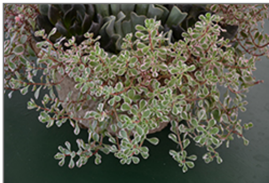
Tricolor Stonecrop