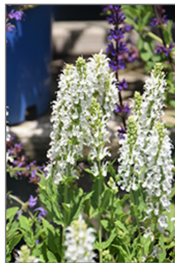
Snow Hill Sage flowers