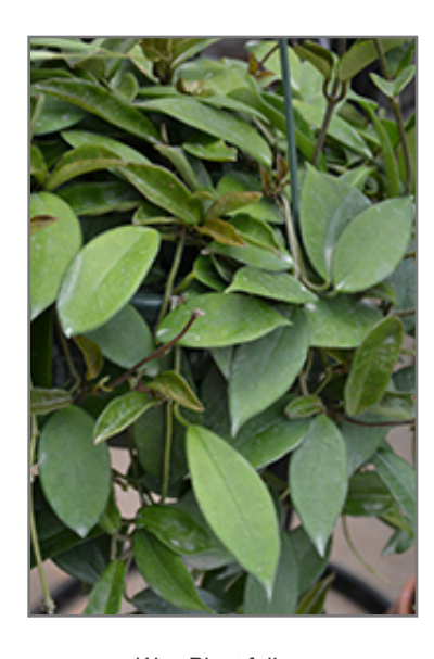
Wax Plant foliage

When grown indoors, Wax Plant can be expected to grow to be about 10 inches tall at maturity, with a spread of 4 feet. It grows at a medium rate, and under ideal conditions can be expected to live for approximately 10 years. This houseplant performs well in both bright or indirect sunlight and strong artificial light, and can therefore be situated in almost any well-lit room or location. It is very adaptable to both dry and moist soil, but will not tolerate any standing water. The surface of the soil shouldn't be allowed to dry out completely, and so you should expect to water this plant once and possibly even twice each week. Be aware that your particular watering schedule may vary depending on its location in the room, the pot size, plant size and other conditions; if in doubt, ask one of our experts in the store for advice. It is particular about its soil conditions, with a strong preference for rich, acidic soil. Contact the store for specific recommendations on pre-mixed potting soil for this plant.