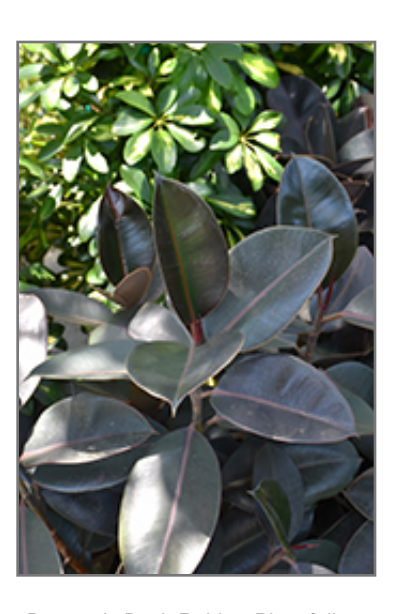
Burgundy Bush Rubber Plant foliage

When grown indoors, Burgundy Bush Rubber Plant can be expected to grow to be about 8 feet tall at maturity, with a spread of 6 feet. It grows at a medium rate, and under ideal conditions can be expected to live for approximately 50 years. This houseplant will do well in a location that gets either direct or indirect sunlight, although it will usually require a more brightly-lit environment than what artificial indoor lighting alone can provide. It prefers dry to average moisture levels with very well-drained soil, and may die if left in standing water for any length of time. This plant should be watered when the surface of the soil gets dry, and will need watering approximately once each week. Be aware that your particular watering schedule may vary depending on its location in the room, the pot size, plant size and other conditions; if in doubt, ask one of our experts in the store for advice. It is not particular as to soil type or pH; an average potting soil should work just fine.