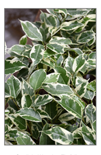
Starlight Weeping Fig foliage

When grown indoors, Starlight Weeping Fig can be expected to grow to be about 5 feet tall at maturity, with a spread of 3 feet. It grows at a medium rate, and under ideal conditions can be expected to live for approximately 50 years. This houseplant will do well in a location that gets either direct or indirect sunlight, although it will usually require a more brightly-lit environment than what artificial indoor lighting alone can provide. It does best in average to evenly moist soil, but will not tolerate standing water. The surface of the soil shouldn't be allowed to dry out completely, and so you should expect to water this plant once and possibly even twice each week. Be aware that your particular watering schedule may vary depending on its location in the room, the pot size, plant size and other conditions; if in doubt, ask one of our experts in the store for advice. It is not particular as to soil type or pH; an average potting soil should work just fine. Be warned that parts of this plant are known to be toxic to humans and animals, so special care should be exercised if growing it around children and pets.