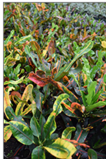
Mammy Croton in full

This is a dense herbaceous evergreen houseplant with an upright spreading habit of growth. Its wonderfully bold, coarse texture is quite ornamental and should be used to full effect. This plant should not require much pruning, except when necessary to keep it looking its best.