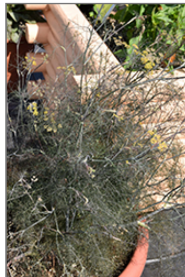
Licorice Towers Fennel