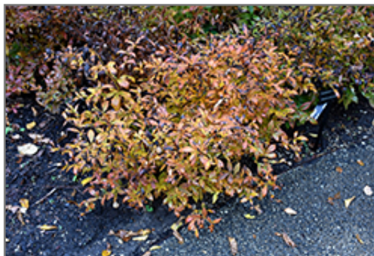
Bowman's Root in fall