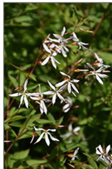
Bowman's Root flowers

This plant will require occasional maintenance and upkeep, and should be cut back in late fall in preparation for winter. It is a good choice for attracting bees and butterflies to your yard. It has no significant negative characteristics.