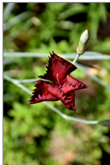
Grenadin King Of The Blacks Carnation flowers

Grenadin King Of The Blacks Carnation is recommended for the following landscape applications;