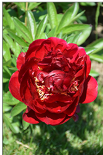
Buckeye Belle Peony flowers