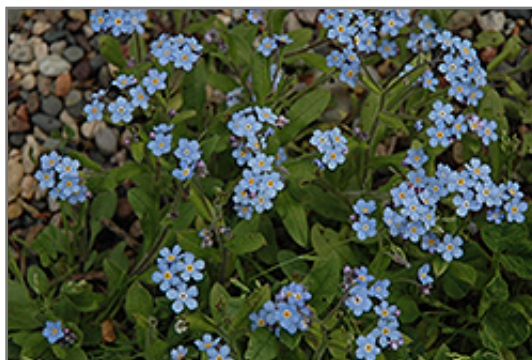
Forget-Me-Not flowers