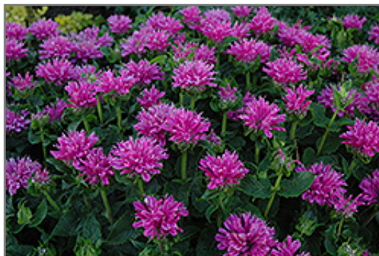
Petite Delight Beebalm flowers