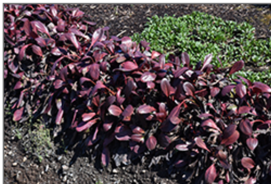
Flirt Bergenia foliage