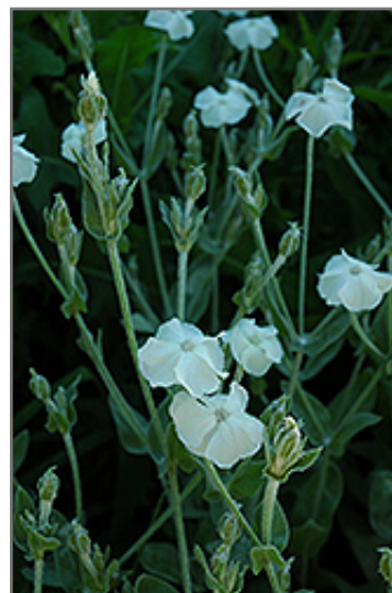
White Rose Campion flowers