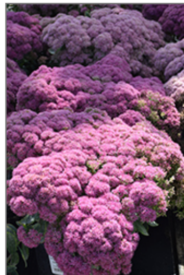
Powderpuff Stonecrop flowers