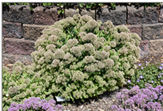
Powderpuff Stonecrop in bloom

Powderpuff Stonecrop is a fine choice for the garden, but it is also a good selection for planting in outdoor pots and containers. It is often used as a 'filler' in the 'spiller-thriller-filler' container combination, providing a mass of flowers and foliage against which the thriller plants stand out. Note that when growing plants in outdoor containers and baskets, they may require more frequent waterings than they would in the yard or garden.