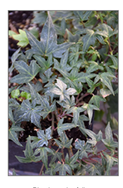
Ritterkreuz Ivy foliage

When grown indoors, Ritterkreuz Ivy can be expected to grow to be only 6 inches tall at maturity, with a spread of 10 feet. It grows at a medium rate, and under ideal conditions can be expected to live for approximately 30 years. This houseplant performs well in both bright or indirect sunlight and strong artificial light, and can therefore be situated in almost any well-lit room or location. It prefers to grow in average to moist soil. The surface of the soil shouldn't be allowed to dry out completely, and so you should expect to water this plant once and possibly even twice each week. Be aware that your particular watering schedule may vary depending on its location in the room, the pot size, plant size and other conditions; if in doubt, ask one of our experts in the store for advice. It is not particular as to soil pH, but grows best in rich soil. Contact the store for specific recommendations on pre-mixed potting soil for this plant. Be warned that parts of this plant are known to be toxic to humans and animals, so special care should be exercised if growing it around children and pets.