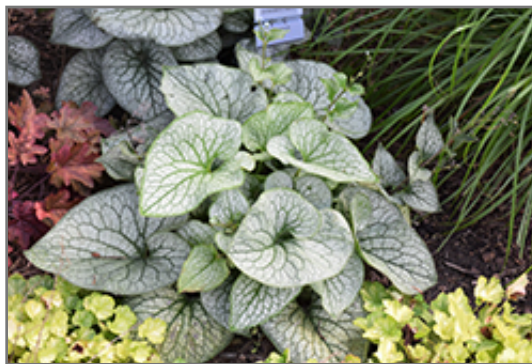
Queen of Hearts Bugloss foliage