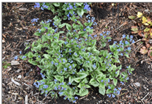
Queen of Hearts Bugloss in bloom

Queen of Hearts Bugloss will grow to be about 18 inches tall at maturity extending to 30 inches tall with the flowers, with a spread of 3 feet. When grown in masses or used as a bedding plant, individual plants should be spaced approximately 30 inches apart. It grows at a medium rate, and under ideal conditions can be expected to live for approximately 10 years. As an herbaceous perennial, this plant will usually die back to the crown each winter, and will regrow from the base each spring. Be careful not to disturb the crown in late winter when it may not be readily seen!