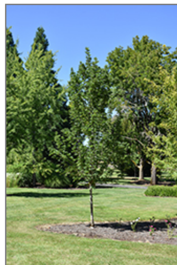
Powder Keg Sugar Maple